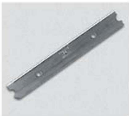
Lamina de substituição p/ raspador 5141101