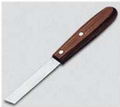
Espátula p/ massa 5162500

PARA ENCOMENDAR LIGUE: TEL: 21.811.03.80 FAX: 21.813.42.69