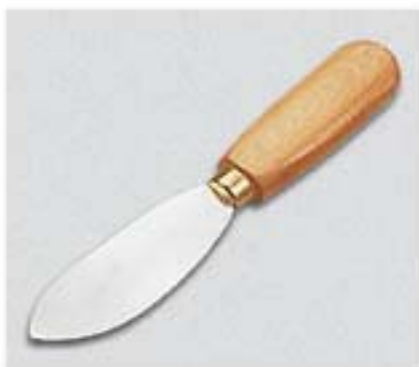
Espátula p/massa 5163300