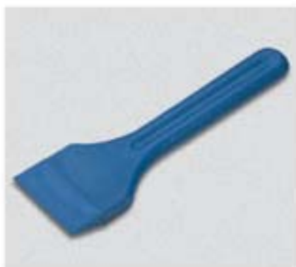
Espátula plástico 5165300