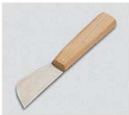
Espátula p/massa 5163400

PARA ENCOMENDAR LIGUE: TEL: 21.811.03.80 FAX: 21.813.42.69