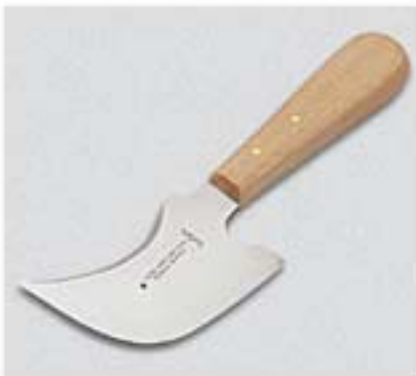
Faca p/ massa Don Carlos 5102501