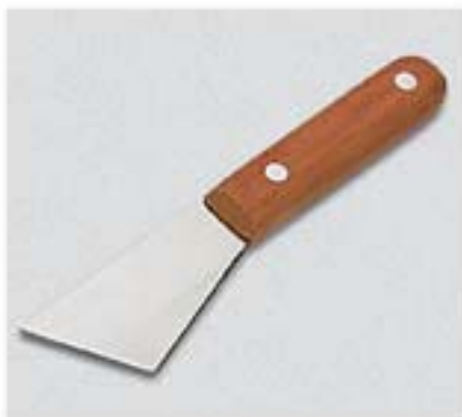
Espátula p/massa 5163200