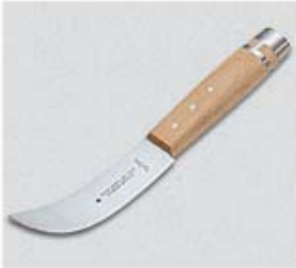
Faca p/ massa Don Carlos 5102400

PARA ENCOMENDAR LIGUE: TEL: 21.811.03.80 FAX: 21.813.42.69