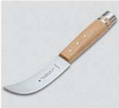
Faca p/ massa Don Carlos 5102401