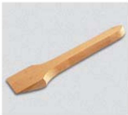
Espátula madeira 5165000