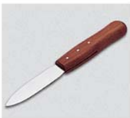
Espátula p/massa 5162200