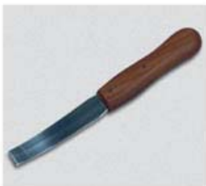
Espátula p/massa 5162900