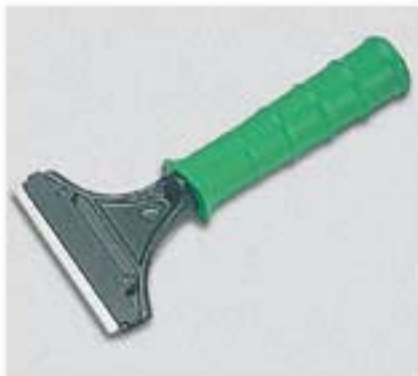
Raspador p/ vidro 5141100

PARA ENCOMENDAR LIGUE: TEL: 21.811.03.80 FAX: 21.813.42.69