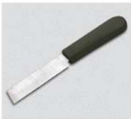
Espátula p/ massa 5164000