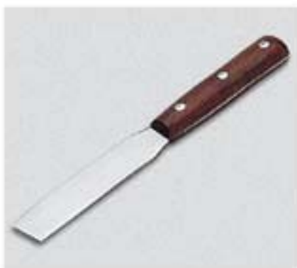
Espátula p/massa 5162100