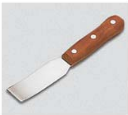
Espátula p/massa 5162628

PARA ENCOMENDAR LIGUE: TEL: 21.811.03.80 FAX: 21.813.42.69