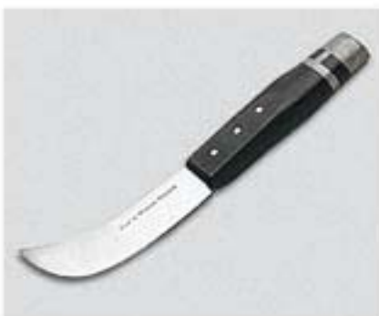
Faca p/ massa 5102200